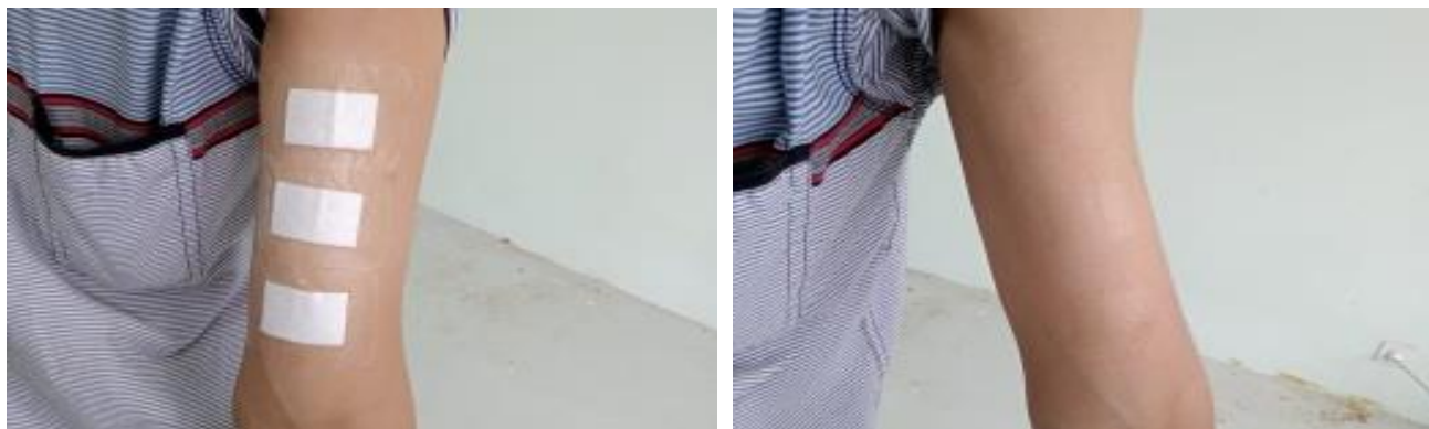
Figure 2: Irritation test Kligman's method