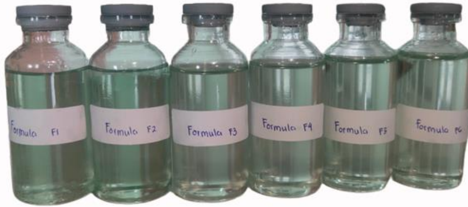
Figure 1: The formulas appearance