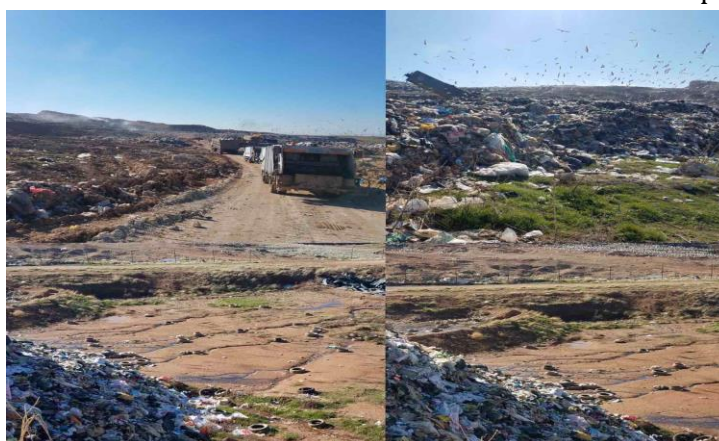
Figure 2: Different views of Kwashe open landfill, showing direct thrown of garbage, release of self-igniting gasses, attraction of wild bird to organic food waste and many drains of leachate under the heap of landfill waste

municipal garbage is more than the capacity of the waste separation factory, a huge amount of these wastes is thrown directly into the open landfill as shown in figure 2. Figure 2 also shows release of self-igniting gasses, attraction of wild bird to organic food waste and many drains of leachate under the heap of landfill waste [6].