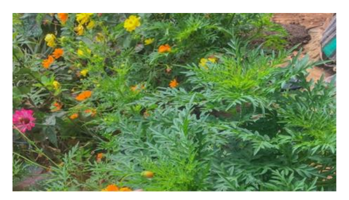
Figure 1: Marigold plant (Tegetes erecta)